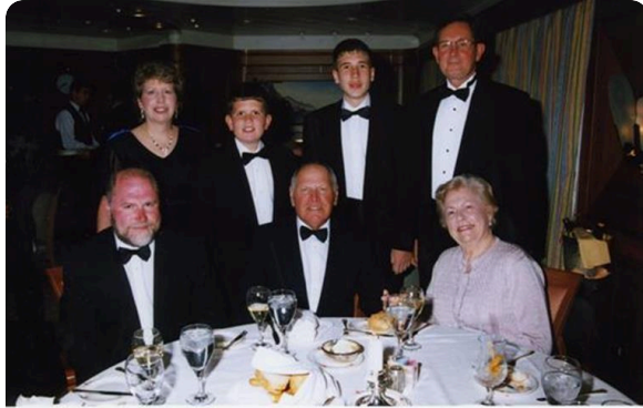
SEA PRINCESS INAUGURAL SEASON PRINCESS CRUISES